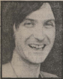
DAVE DAVIES "I was taken over"